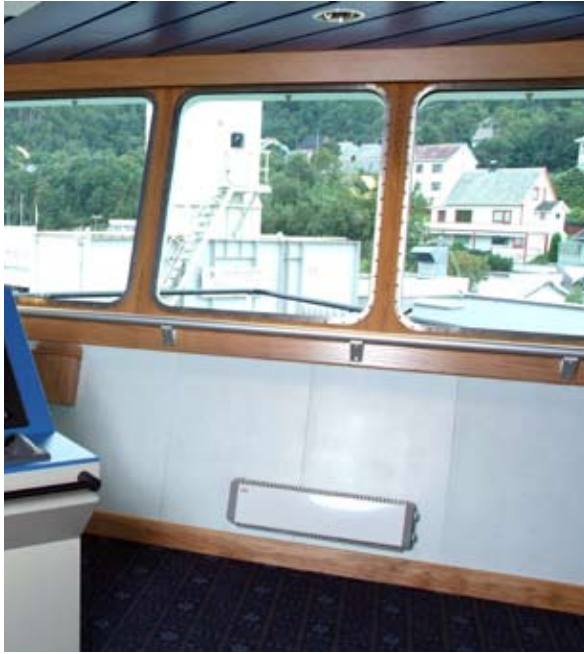
The small size and effortless installation make Thermowarm easy to position even in confined areas such as a control cabin.