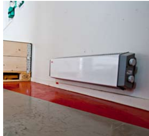
Thermowarm is available with a white front, with or without a circuit breaker.