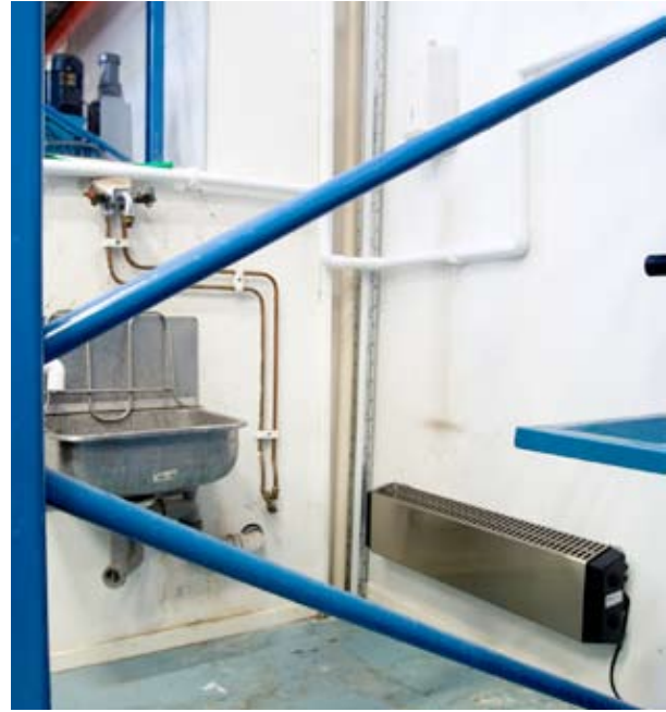
In the stainless steel design Thermowarm withstands corrosive environments.