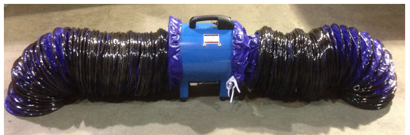
Duct up to 20 metres with each extractor

Customer Order Line 01527 830610 Technical Advice 01527 830616 E: sales@broughtoneap.co.uk F: 01527 527558