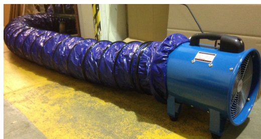
Ideal for extraction & fresh air supply